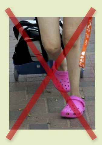
Example of "CROCS" shoes that are NOT ALLOWED to be worn at NCC.